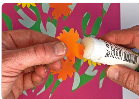
5 Glue the flower and leaf shapes onto a contrasting coloured sheet of paper.