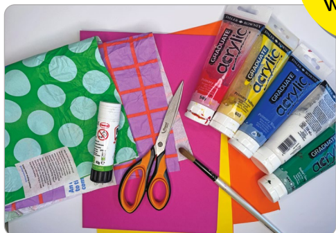
1 Start by gathering together all the equipment you'll need.