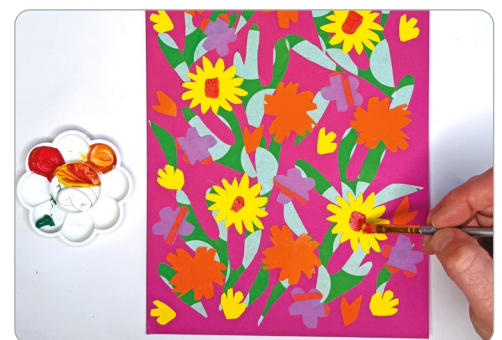
6 Use paint to add details to the centre of your flowers.

Head to theweekjunior.co.uk/activityhub for more crafts and recipes.