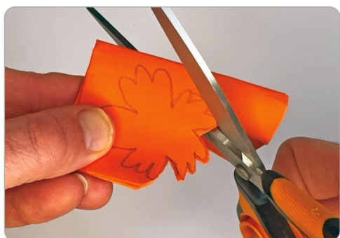
4 Cut out a shape from a folded piece of paper, then do the same with the others.