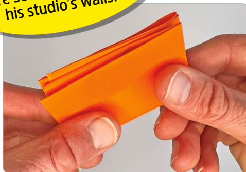
2 Fold your coloured sheets of paper carefully three times.