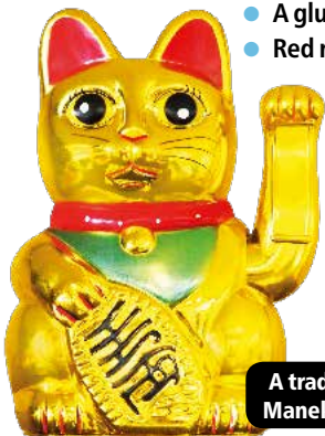
A traditional Maneki Neko.