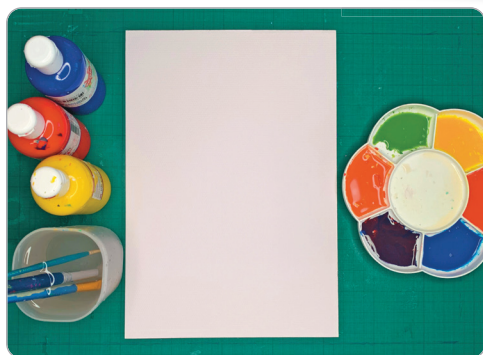
1 Gather all your equipment together. Paints, paintbrushes, paper and water.