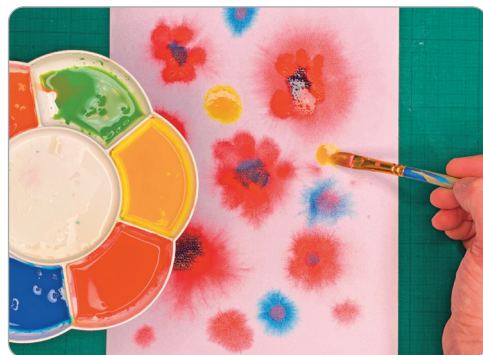
4 Use different colours and add darker colours in the centres of your flowers.