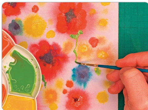
5 Use green paint and a smaller brush to add in details like leaves and stems.