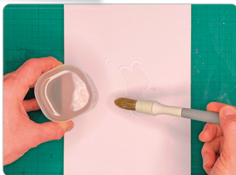
2 Start by brushing water onto the paper until it is completely soaked.