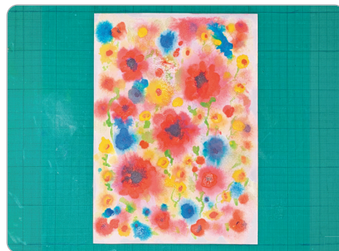
6 Leave your masterpiece to dry and stand back to admire your creation.

Head to theweekjunior.co.uk/activityhub for more crafts and recipes.